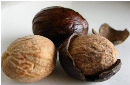
Think Spice, Think Nutmeg